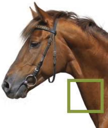
Picture 1: Probeentnahme beim Pferd

Manes or tail hair are less suitable. Unless sampling occurs close to the skin, test results of long strands of hair would resemble a very long period of past time exposure. In most cases, this would not provide diagnostic information of interest to therapeutic treatment.